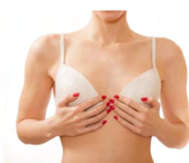
Breast Augmentation for Thin Patients